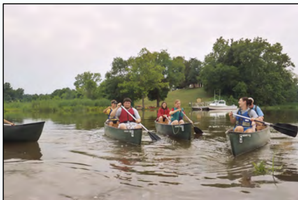
Jug Bay Canoe Trip