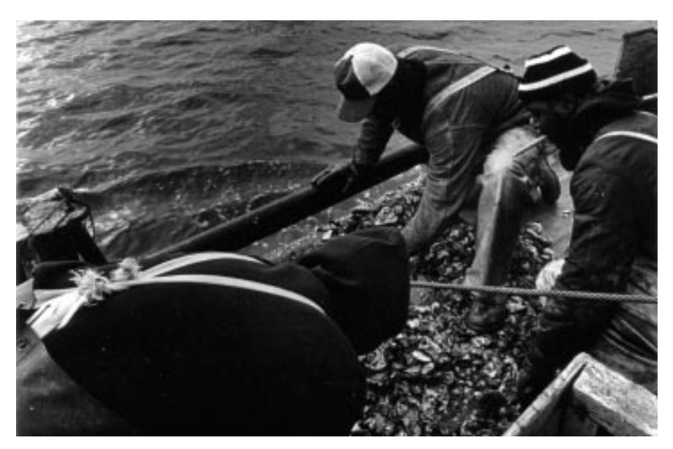
Once the Chesapeake's most lucrative fishery, the oyster has fallen on hard times. Maryland's 1994-95 harvest of some 162,000 bushels represents a fraction — about 14% — of the harvests of only a decade ago.

New molecular tools have been making it possible for Anderson and other scientists to better examine the chemical weaponry that both oysters and protozoans deploy. For example, using molecular probes and chemiluminescent analysis to detect and quantify ROI production, Anderson no longer depends on counting cells