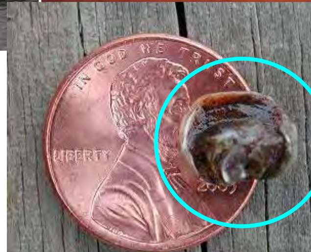
Same oyster after 28 day in FLUPSY system