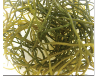
Researchers from the Smithsonian Environmental Research Center collect invasive organisms from bait packaging material.