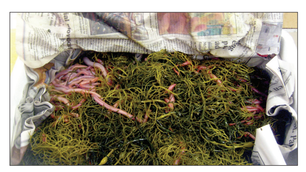
Bait worms come packaged in seaweed that can carry tiny invasive species such as crabs and snails, which can harm Mid-Atlantic fisheries.

Bait worms and their packaging come from companies that are outside the Mid-Atlantic region. Bait worms are usually packaged