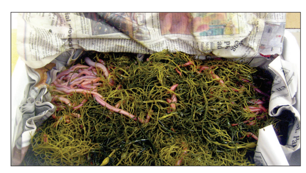
Bait worms come packaged in seaweed that can carry tiny invasive species such as crabs and snails, which can harm Mid-Atlantic fisheries.

Bait worms and their packaging come from companies that are outside the Mid-Atlantic region. Bait worms are usually packaged