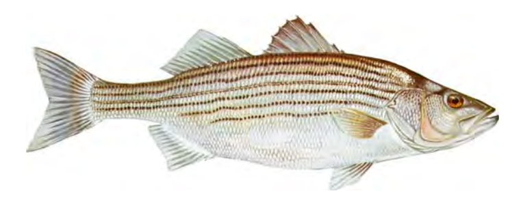
Figure 1. Striped bass (Morone saxatilis).

triped bass have recently been hailed as one of the greatest success stories of fisheries management in Chesapeake Bay. The Atlantic coast striped bass fishery collapsed in the 1970s and early 1980s and in response Maryland and Virginia imposed a harvest moratorium on the species. The fishery was re-opened in 1990 to commercial watermen after recruitment levels rebounded. The population was considered fully restored in 1995. The recovery was likely a result of both successful management and environmental conditions favorable for early life survival. Precautionary management since that period has allowed the population to support a large commercial and recreational fishery in Chesapeake Bay. Currently the stock is actively managed through a Baywide quota, which covers the three jurisdictions in the Chesapeake Bay (Maryland, Potomac River, and Virginia waters) for both the recreational and commercial fisheries. The Chesapeake Bay hosts a year-round adult striped bass population and is an important spawning and nursery habitat for both the Bay stock and the larger Atlantic Coast population. Striped bass are long lived — reaching ages of 30-plus years and weights in excess of 100 pounds. They are considered excellent recre-