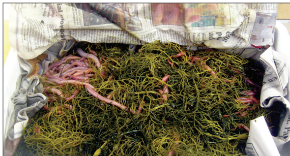
Bait worms come packaged in seaweed that can carry tiny invasive species such as crabs and snails, which can harm Mid-Atlantic fisheries.

Bait worms and their packaging come from companies that are outside the Mid-Atlantic region. Bait worms are usually packaged