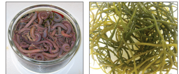
Researchers from the Smithsonian Environmental Research Center collect invasive organisms from bait packaging material.