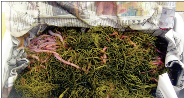
Bait worms come packaged in seaweed that can carry tiny invasive species such as crabs and snails, which can harm Mid-Atlantic fisheries.

Bait worms and their packaging come from companies that are outside the Mid-Atlantic region. Bait worms are usually packaged