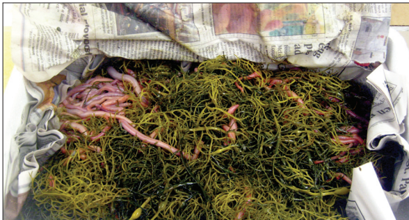
Bait worms come packaged in seaweed that can carry tiny invasive species such as crabs and snails, which can harm Mid-Atlantic fisheries.

Bait worms and their packaging come from companies that are outside the Mid-Atlantic region. Bait worms are usually packaged