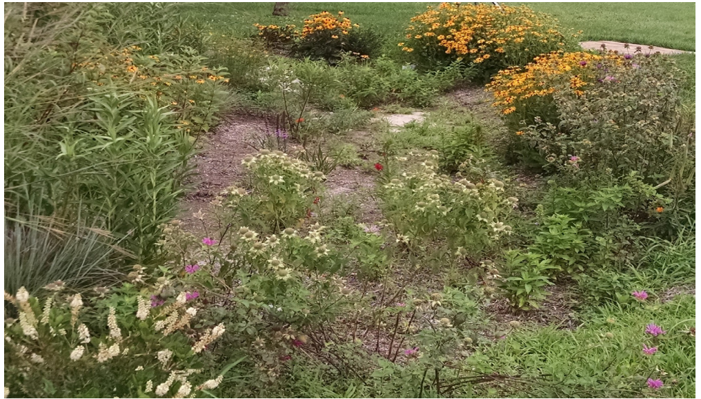
Like any other type of home landscaping or garden bed, rain gardens need maintenance too.