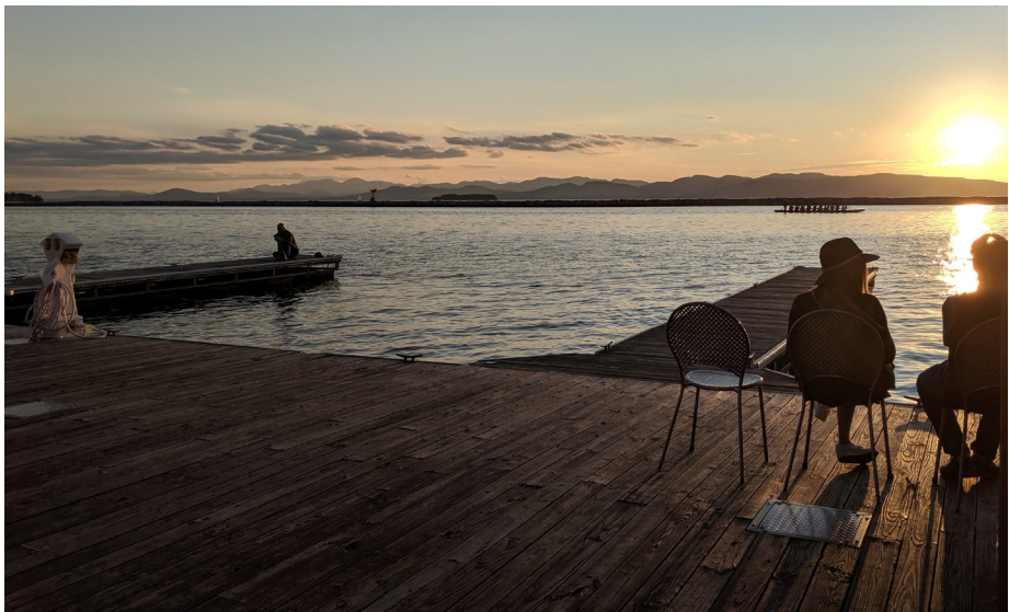
Lake Champlain at sunset.