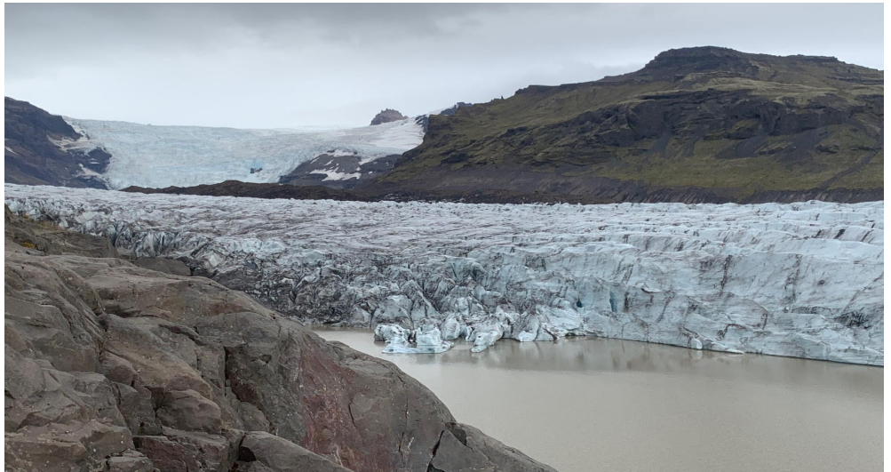
Svinafellsjokull Glacier in Iceland is one of many they monitor with regard to climate change and the amount of "retreat" that is occurring.