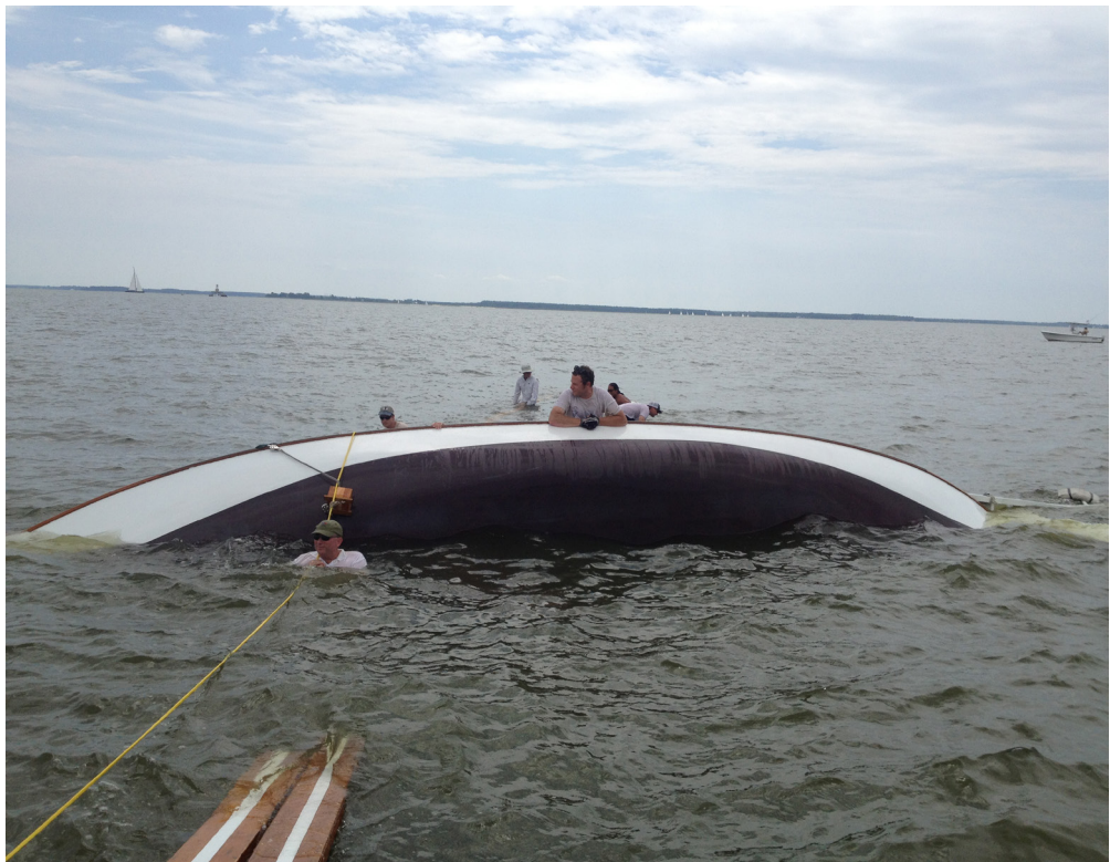
The log canoe Edmee S. capsized somewhere in the Tred Avon River.

Log canoe racing is always unpredictable, but knowing about the water quality on race weekends was a small way to manage some of that uncertainty. I look forward to using the app again next season, whether for racing or just enjoying time on the water in the Land of Pleasant Living.