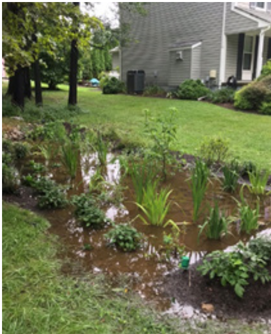
GI rain garden at work in a 1 inch rainstorm.