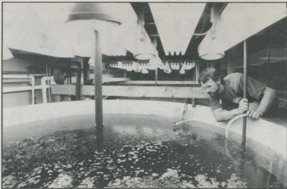
This tank is one of 40 mesocosms at the CEES Horn Point Environmental Laboratory set up to mimic the dynamic conditions of a natural ecosystem.

These observations, however, do not take into account the more complex reactions a contaminant undergoes in a real aquatic system or an