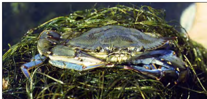
Figure 3. Blue crab in submerged aquatic vegetation.

Fragmentation of seagrass patches has differential effects on predation, cannibalism, and survival of different age classes of blue crabs due to the high ratio of edge to interior area in small patches. Small patches support elevated densities and yield higher survival rates of juvenile blue crabs possibly due to more frequent recruitment encounters and food supply transport. However, smaller patches may also make juvenile crabs more prone to predation and cannibalism. Removal of natural marshes alters benthic communities and habitats in the nearshore subtidal zone. Residential and commercial shoreline development play a key role in this regard, replacing natural marsh habitat with inert structures including bulkhead and riprap used to stabilize shore-