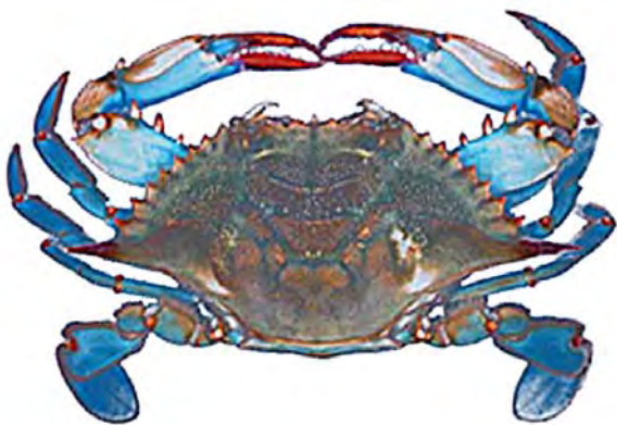
Figure 1. Blue crab ( Callinectes sapidus ).

The blue crab, Callinectes sapidus , is a keystone species which plays an integral ecological, economic, and sociological role in Chesapeake Bay. The blue crab functions as both predator and prey in the Bay's complex estuarine foodweb and occupies a variety of critical habitats impacted by human activity. Blue crabs exhibit a complex life history, disperse between estuarine and marine habitats, and are particularly sensitive to fluctuations in environmental conditions. The robust fishery is intricate, divided between commercial and recreational sectors, a suite of fishing gear and effort levels, and several different markets. Concern over depressed population levels in 2008 resulted in Maryland and Virginia implementing a rebuilding strategy which includes limiting the fall harvest of migrating females, closing the winter female dredge harvest in Virginia, and extending the spawning season sanctuary. Following these new regulations, the female blue crab population increased by 200% from the period 2008 to 2009. While coordinated multi-jurisdictional, single-species management has been successful in recent years, fisheries researchers, managers, and policy makers recognize that blue crabs are particularly susceptible to ecosystem changes.