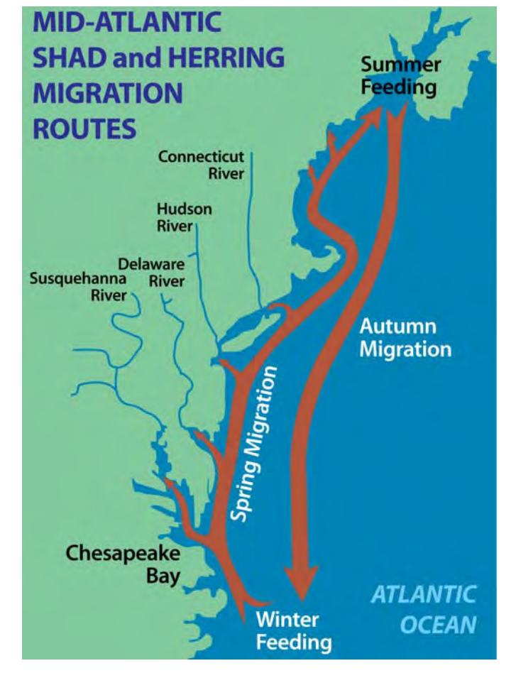
Figure 3. Migration routes along the East Coast of the U.S. for shad and river herring.

Dams and other artificial structures in streams create migratory barriers that represent one of the most significant factors causing the decline of anadromous alosine runs. The types of dams and obstacles commonly found in the Chesapeake Bay region are for hydroelectric power, flood control, water supply, agriculture, aesthetic/residential, former hydro-mechanical (mill), and former canal feeders.