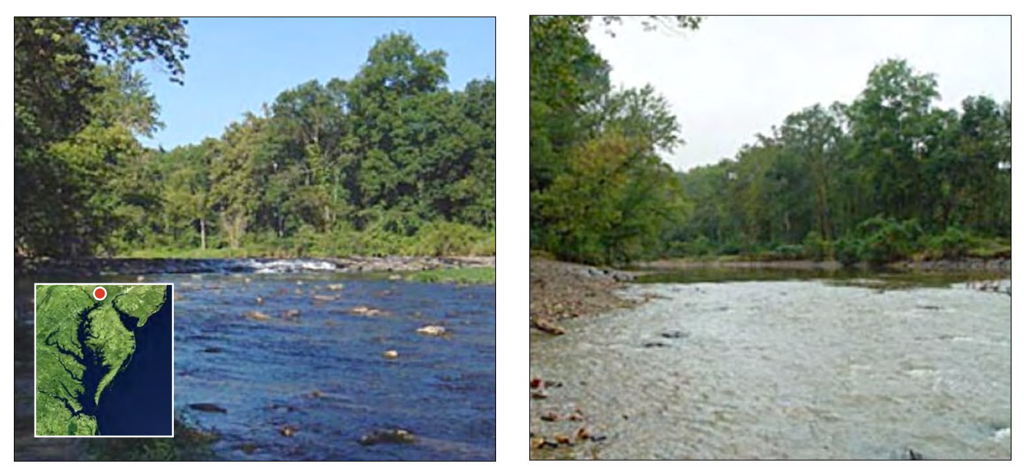
Figure 4. As part of Maryland DNR's Fish Passage Program, the removal of Octoraro Creek Dam restored access to 20 miles of suitable habitat for shad and herring. The photos above show the creek — a tributary of the Susquehanna River — before and after dam removal. Credit: Photographs, Maryland Department of Natural Resources; watershed map, NASA.

landfills can result in the loss of natural shoreline; wing dams often change flow patterns; and piers, platforms, and jetties potentially provide cover for predators and degrade habitat quality. Channelization for shipping or flood control can also have multiple detrimental effects. Dredging to deepen channels can cause short term increases in turbidity and impede fish movements and decrease primary productivity. Dredging deeper channels often requires concomitant widening of channels, which may eliminate shallows or bottom structures which are vital to various life stages of alosines species. Sedimentation from dredging or construction projects may cover preferred spawning sites. These activities may also alter river current patterns, velocities, and the position of estuarine salt fronts.