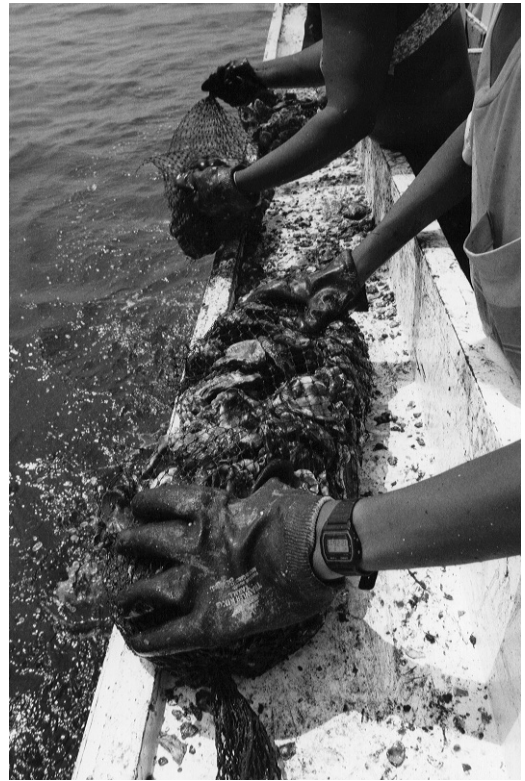
Oyster shell is placed overboard to stabilize bottom grounds and provide a firm substrate for planting oyster seed.

It should be noted that many areas are good for oyster survival and growth but have bottom types that are poor for supporting oysters. Preliminary examination might lead one to believe that such areas are unsuitable for oyster farming. This may not be the case. Bottom stabilization is usually not done annually or even between every crop, although it may be advisable to reevaluate the condition of the bottom prior to reseeding and to add a small amount of cultch material if necessary. In most areas it is the initial placement of cultch that comprises the largest expense in stabilization. This initial application may provide an adequate growing bottom for many years with little or no additional shelling necessary. In such areas the costs associated with this initial stabilization could then be spread out over many successive crops.