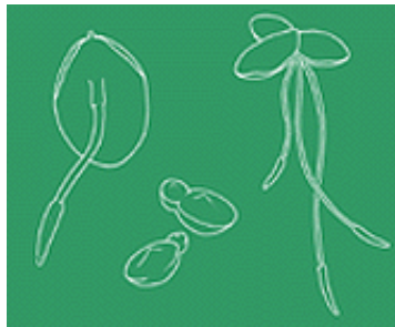
Floating Vegetation: Duckweed Drawing by Karen Teramura