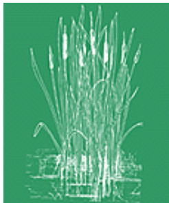
Emergent Vegetation: Cattail From A Manual of Aquatic Plants