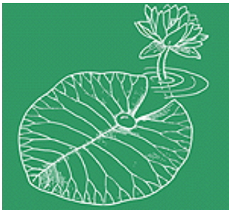
Floating Vegetation: White Water Lily Drawing by Karen Teramura

The easiest and least expensive means of controlling such weeds is to prevent the problem before it starts. An integrated pest management program that uses a combination of control methods coupled with proper pond and watershed management can save pond owners from a lot of headaches in the future.