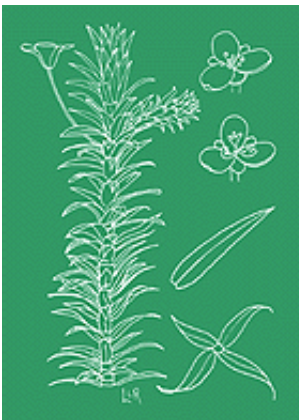
Pictured Above: Submerged vegetation, Brazilian Elodea.