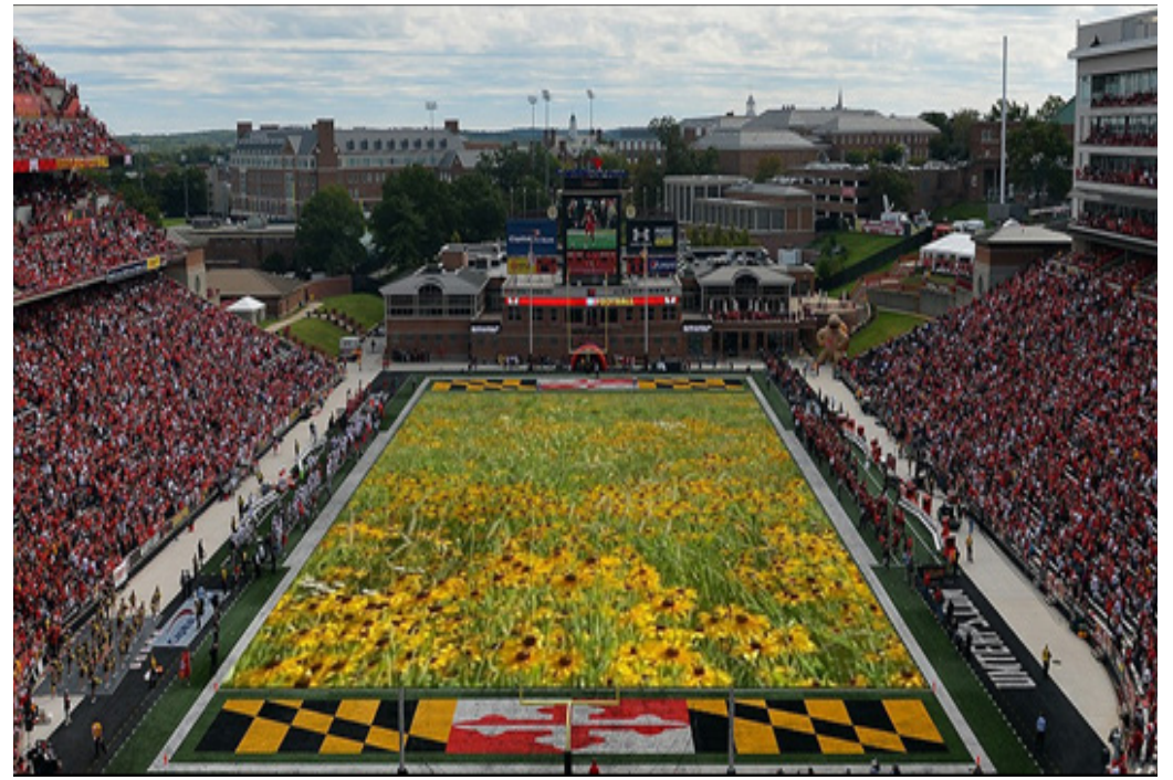
The native plants in five hundred small rain gardens would be enough to cover Capital One Field at Maryland Stadium from end to end. Images modified from Rice County SWCD and UMTerps.com

In case you have ever wondered if a small BMP like a rain garden has any significance, these small areas can add up to make a big difference when it comes to water