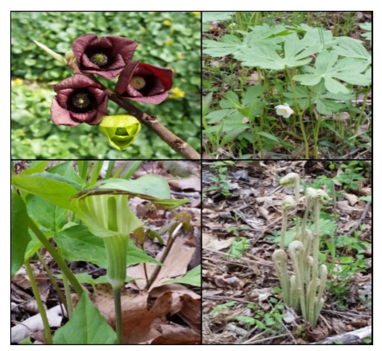
Welcome signs of spring near Norwich Creek. Clockwise from top left: Paw Paw, Mayapple, fern fiddleheads, and Jack-in-the-Pulpit.

The Maryland Sea Grant Extension Watershed Educators Team