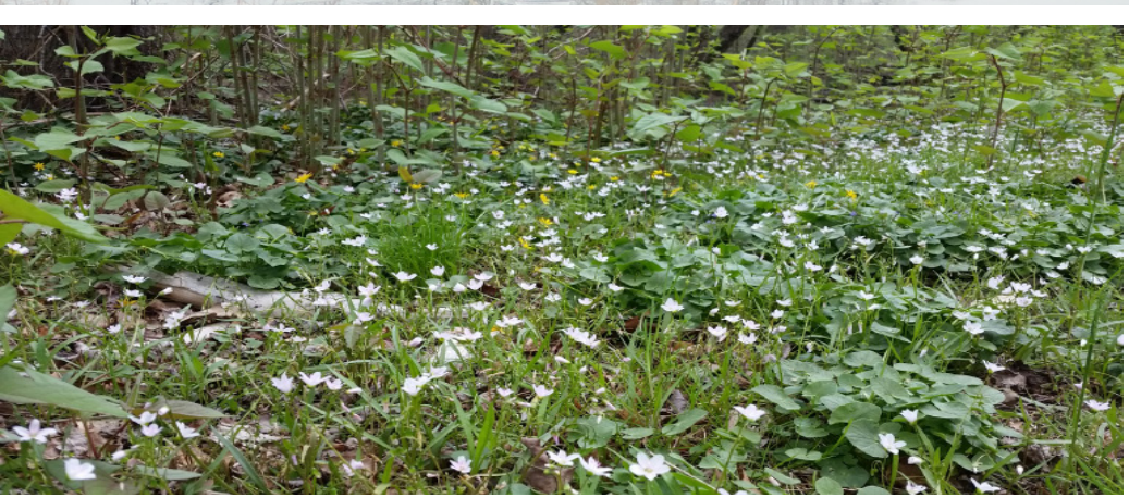
Spring Beauty in bloom near Norwich Creek. Unfortunately their presence is threatened by the encroachment of Japanese Knotweed and Fig Buttercup, also known as Lesser Celandine. Both are non-native, invasive plant species.

"A time of renewal, regeneration, and revitalization"