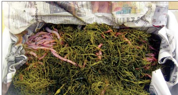
Bait worms come packaged in seaweed that can carry tiny invasive species such as crabs and snails, which can harm Mid-Atlantic fisheries.

Bait worms and their packaging come from companies that are outside the Mid-Atlantic region. Bait worms are usually packaged