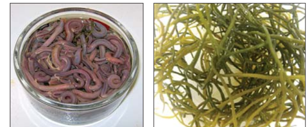
Researchers from the Smithsonian Environmental Research Center collect invasive organisms from bait packaging material.