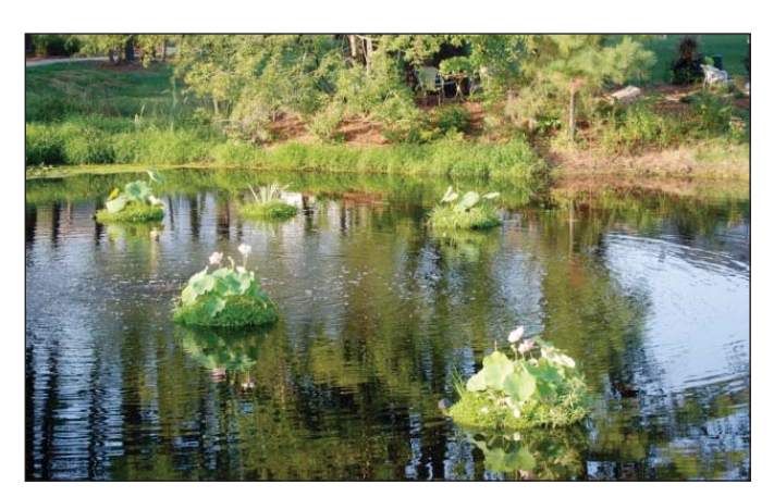
Ponds provide nutrient remediation and habitat for local wildlife. This pond features floating plant rafts that enhance nutrient uptake and make it an attractive feature of the community.

sediment enters the pond, the pond fills and becomes shallower, allowing sunlight to penetrate to the bottom. Nutrients in the water and sediment help spur the growth of nuisance aquatic plants — microscopic algae