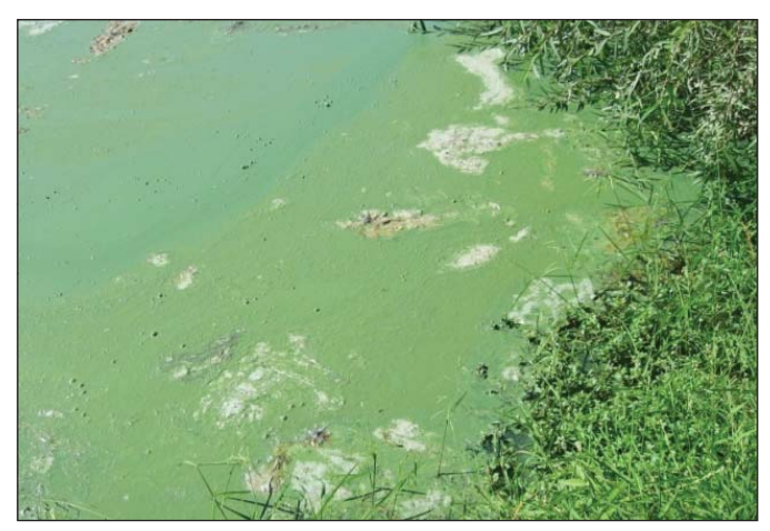
Poor management can reduce pond function, lead to aesthetic problems like this algal bloom, and require costly renovations.

Once nuisance plants have been controlled, native plants can be planted in their place. It is important to consider the nutrient remediation needs of the community, as some plants have higher rates of nutrient uptake than others. Local aquatic plant nurseries can assist in choosing plants that suit the needs of each community.