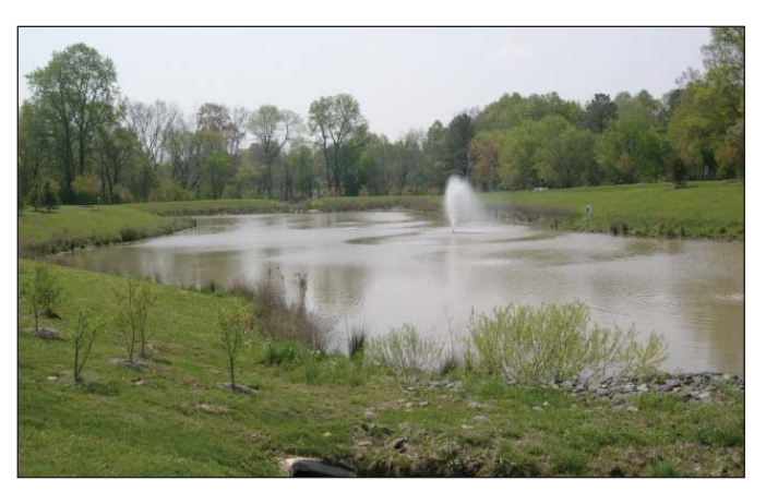
Stormwater ponds, like this one in Easton, Maryland, capture runoff and reduce nutrients in the water.

Stormwater control ponds are designed to trap water running off the watershed. This water often carries with it sediment from surrounding areas as well as nutrients from fertilizer, animal waste, or failing septic systems. As